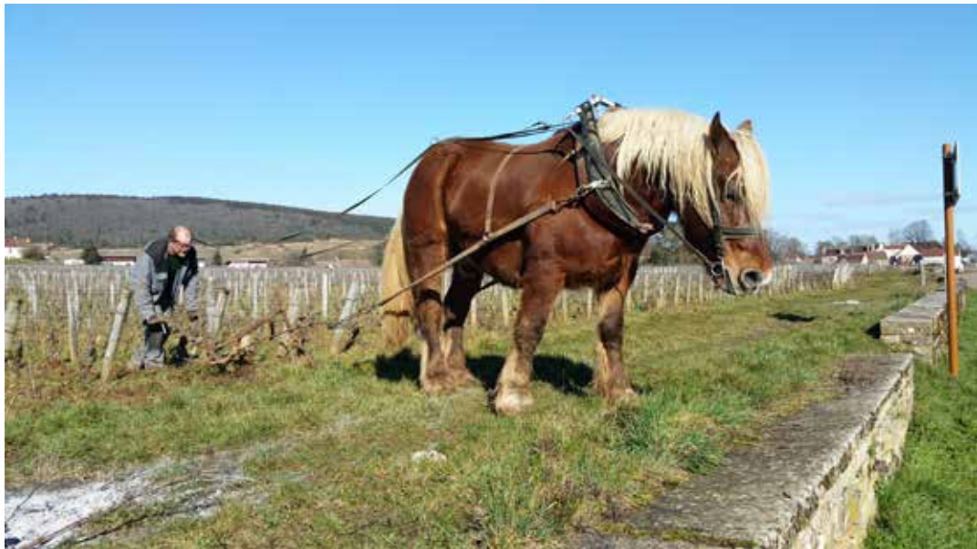
Ploughing by horse in the Grand Crus