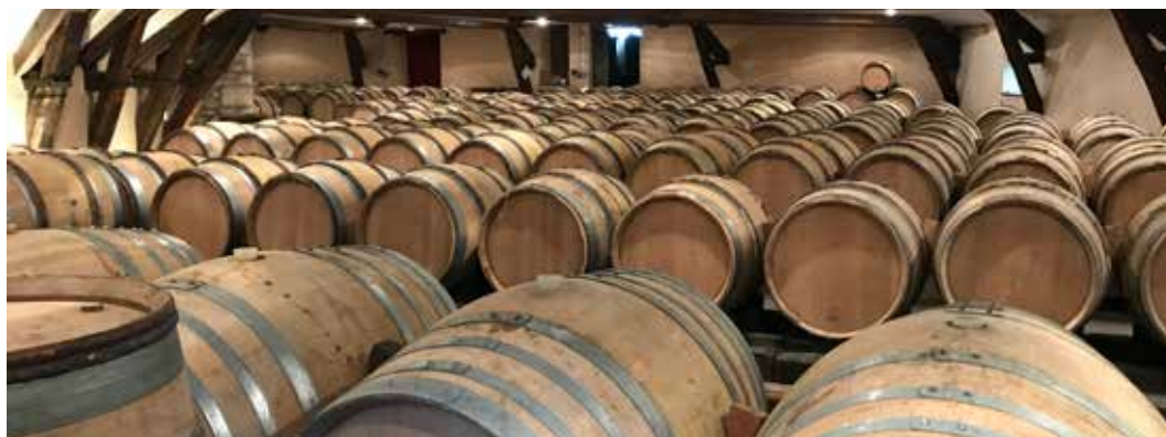
Cellars at Domaine Chanson