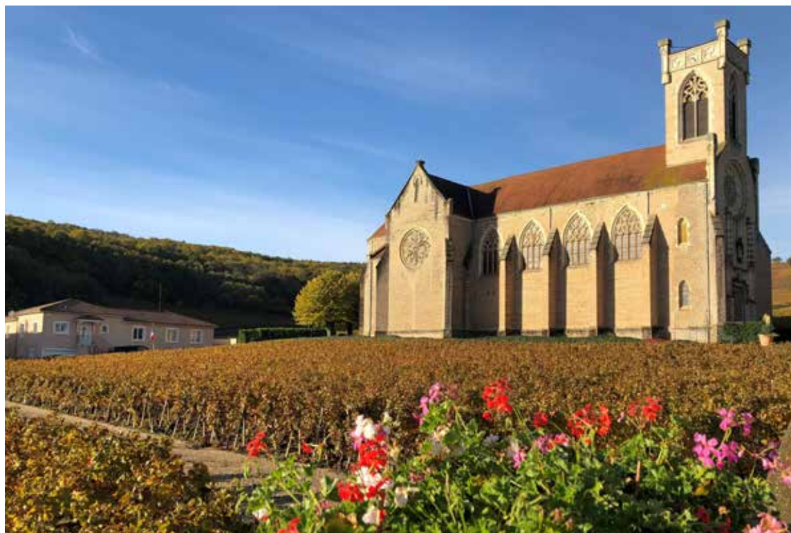
The 'Clos de Bourg' Vineyard in the heart of Fuissé