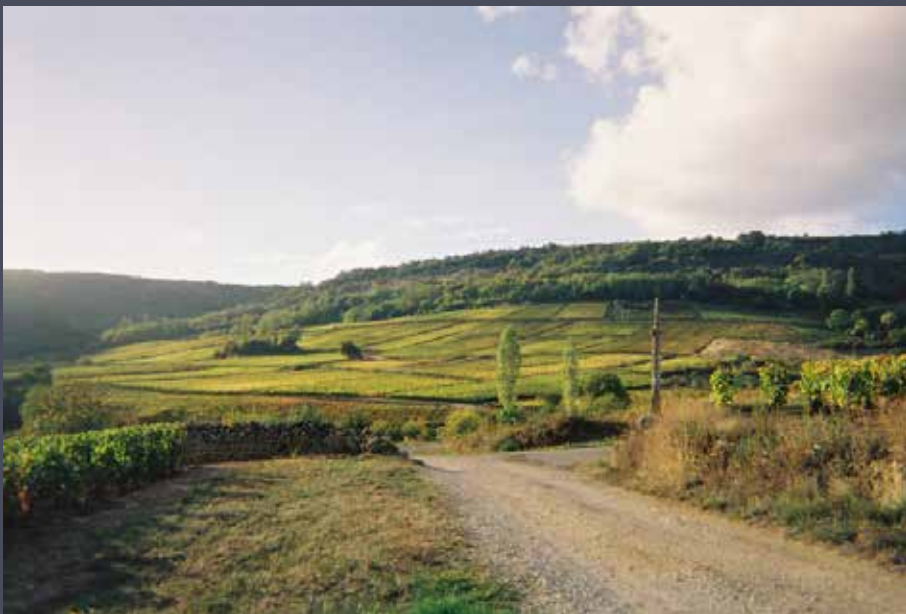
Denis Carre Vineyards

Of all the 42 Premier Cru, the most notable is Clos du Roi (The Royal wine). Named as it was so often favoured by the Kings of France in their day, it sits on a tiny strip of sand and clay deposits, which gives a degree more heat retention and ripening to the Pinot Noir, tasting almost precocious in its youth.