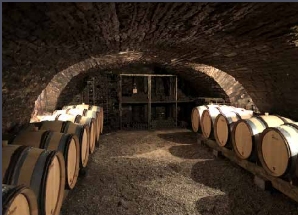
The Cellars at Domaine Denis Carré

Situated in the Cote de Beaune, where smaller valley's cut through the ridge of vineyards that flow down from the Cote de Nuits, the 140 ha of vineyards of Auxey- Duresses lie within such a deep cleft of the ridge, slicing westwards for a mere 3km from the outskirts of Meursault into the hills where a meso-climate gives a degree more warmth, the aspect is south east facing, or the better vines, and the soil is an ideal combination of limestone under a scraping of reddish clay for the higher vineyards, with thicker clay and marl soils lower down. What makes Auxey-Duresses so unique, however, is its ability to make wines similar in style to a good Meursault, but with a degree more bracing acidity, elegance and lightness of touch, less honeyed and a little more saline – making a dry white with less ageing, but more appeal earlier in its life.