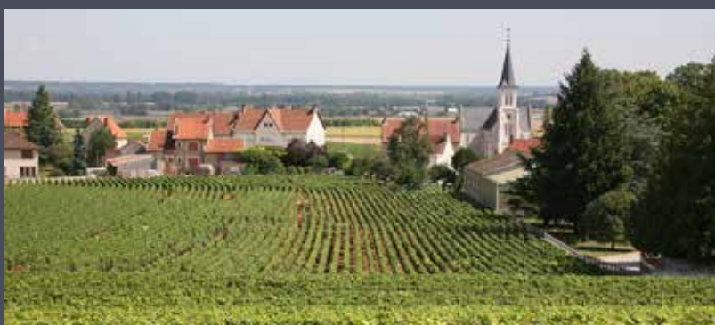
Côte de Nuits

Great Bourgogne Pinot Noir can be found, however, offering a style and quality far above its humble AOC labelling. Wines from top producers in famous villages, are all available, albeit in smaller quantities, yet at remarkably attractive prices. These great domaines will often have a lower yield, more concentration, more typicity and a great degree of regional characteristics, as well as age worthiness and breeding. The name of the producer, however, is crucial to finding a decent bottle.