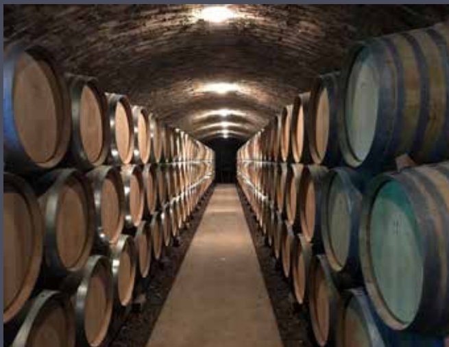
The Cellars at Domaine Tollot-Beaut

Great Bourgogne Pinot Noir can be found, however, offering a style and quality far above its humble AOC labelling. Wines from top producers in famous villages, are all available, albeit in smaller quantities, yet at remarkably attractive prices. These great domaines will often have a lower yield, more concentration, more typicity and a great degree of regional characteristics, as well as age worthiness and breeding. The name of the producer, however, is crucial to finding a decent bottle.