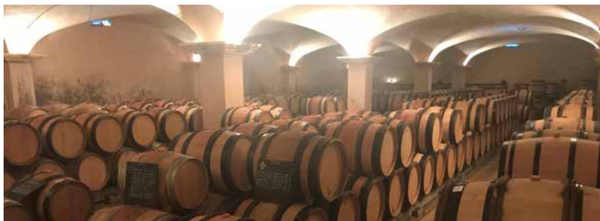
The Cellars at Domaine Mestres-Michelot