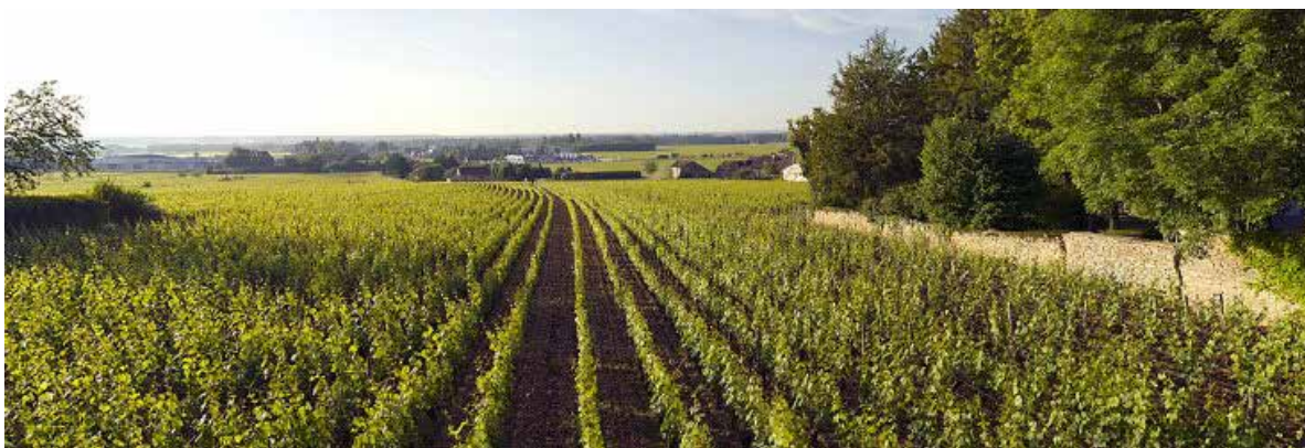
Domaine Machard de Gramont Vineyard