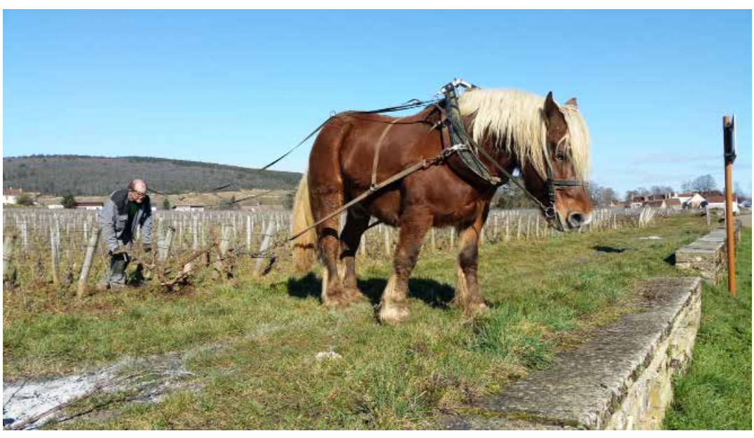
Ploughing by horse in the Grand Crus

Produced from two parcels of vines averaging 85 years old, one in Charmes and one in Mazoyeres totaling only 0.3ha. (It is an interesting peculiarity that Mazoyeres can be used as Charmes Chambertin.) Only 4 barrels were produced of the 2017 vintage. Fermented in 100% new oak and aged for 18 months. A very aristocratic wine, full of power and poise. A superb intensity, the palate is thick and viscous brimming with multi layers of cassis and mulberry fruit, the tannins are finely tuned and there is highly impressive polish to the finish